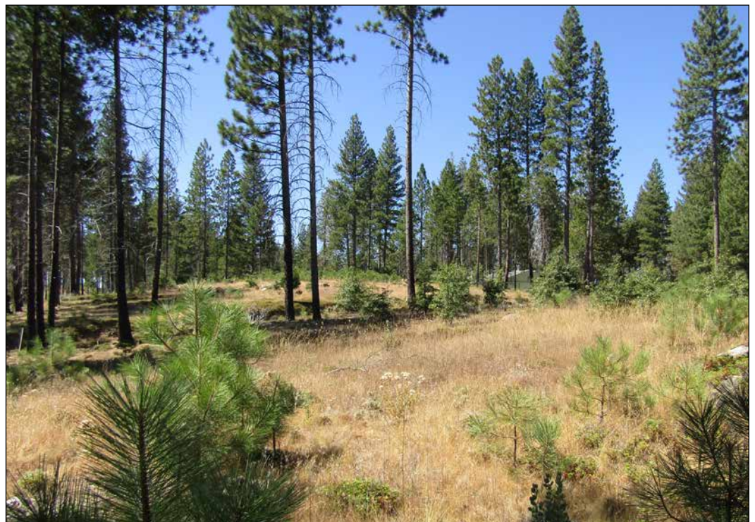
Site proposed for development along highway corridor to Yosemite Park.

www.tuolumnecounty.ca.gov/1204/ Under-CanvasHarding-Flat-LLC