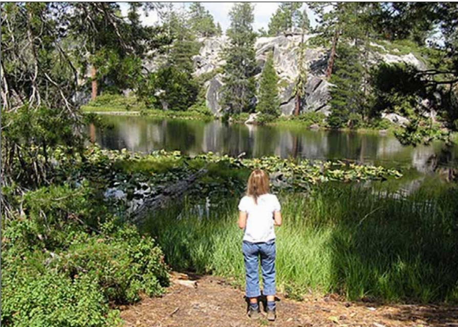
Hiker pauses to take in the beauty of a summer day at Clear Lake in the Bell Roadless Area

Thanks to all of the front line workers and our sincere wishes for good health to you and your families in the months ahead!